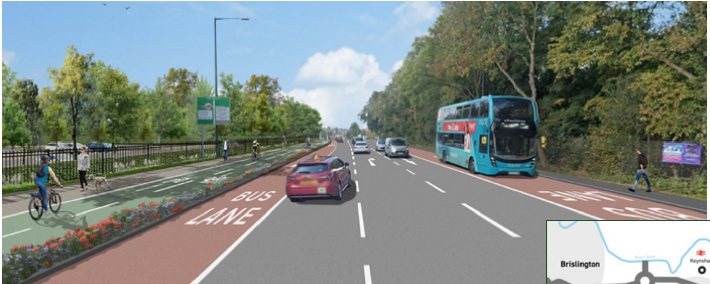
Proposals on the A4 at Brislington Park & Ride include improved walking, cycling and bus infrastructure

We're asking for your views and comments at a very early stage before we progress any further. Nothing is decided at this stage. The detail still needs to be assessed and is not fixed yet, we'd like your feedback on the overall ideas, rather than the details - what you like, what you don't like, and why. Your feedback will shape what happens next.